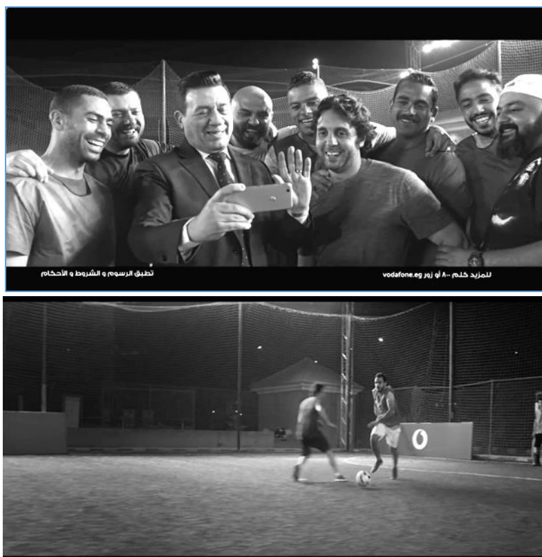
Figure (2) The First Model Advertising Campaign of "Vodafone" Egypt, Vodafone (2018).