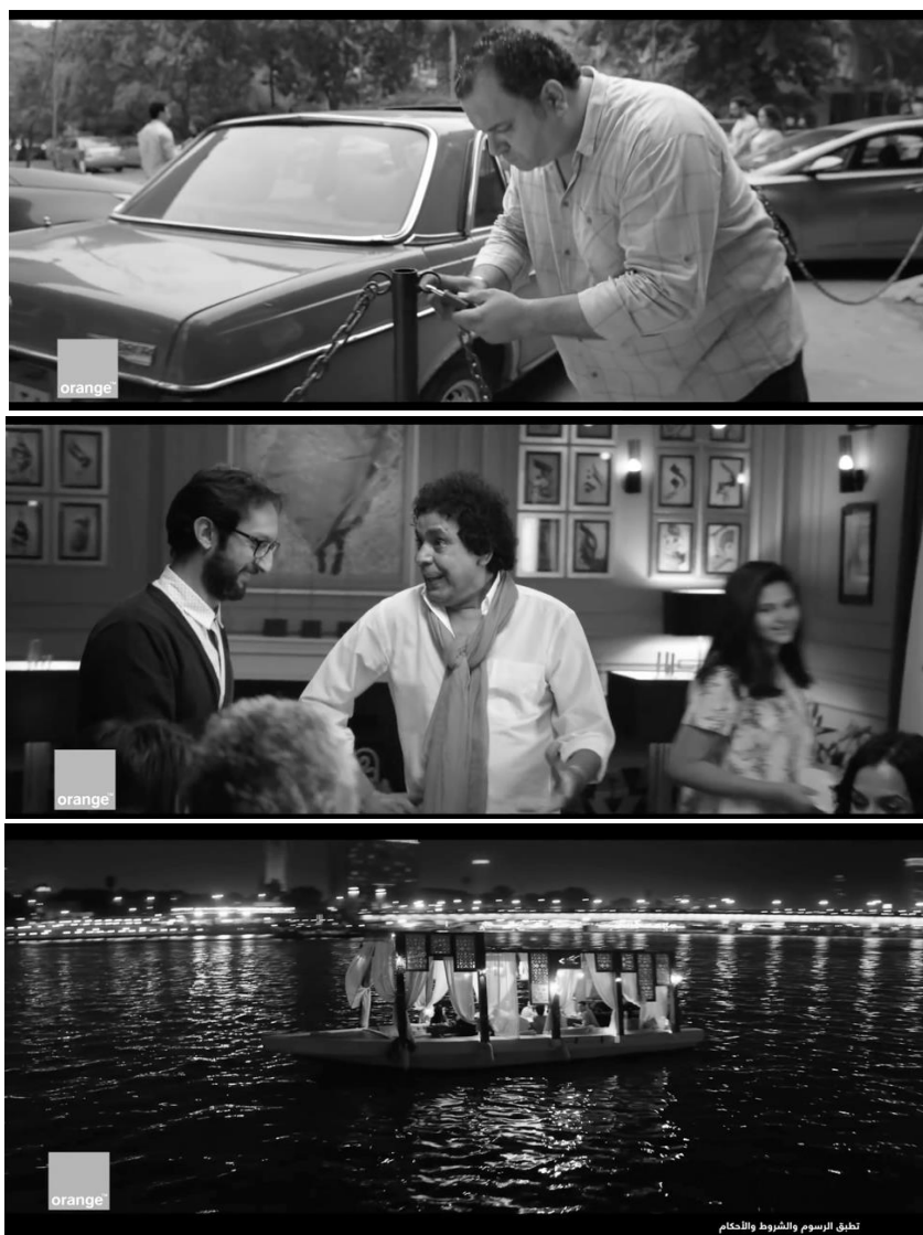
Figure (4) Third Model Advertising Campaign of "Orange" Egypt, Orange (2018)