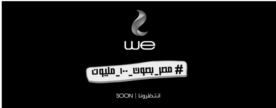
Figure (5) Fourth Model Advertising Campaign of "WE" Egypt, We (2018)