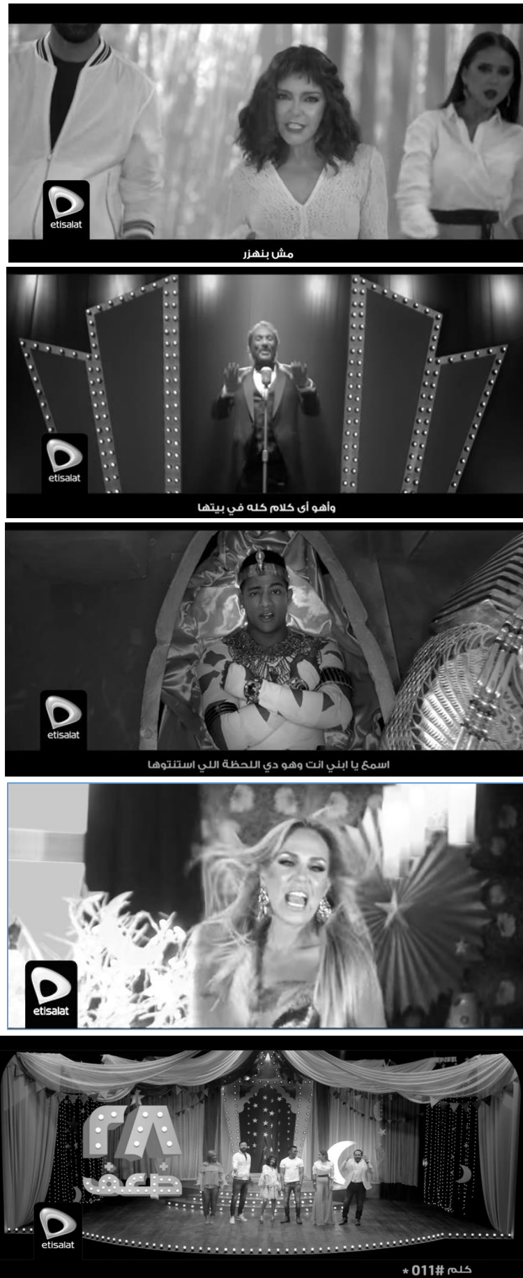
Figure (3) Second Model Advertising Campaign of "Etisalat" Egypt, Etisalat (2018)