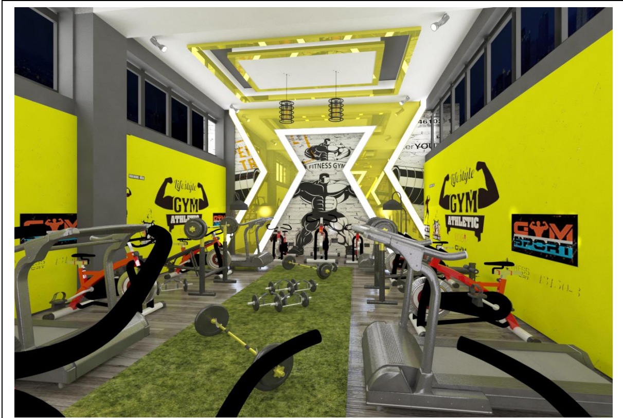
A figure showing the first gym proposal