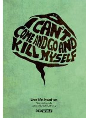
Figure No. (7): Red Wolf's advertising campaign to raise awareness of suicide, the use of letters is simple and clear, to communicate the advertising message quickly and easily.

3. Readability: The height and thickness of the letter must be taken into consideration given the ratio between the height of the letter and the height of the design where the consumer can see the letters clearly.