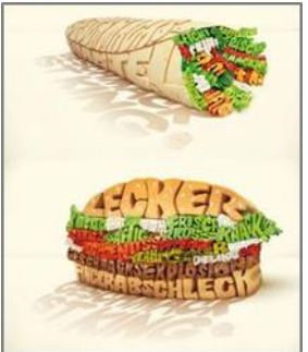
Figure No. (6): An advertising campaign for the Burger King restaurant in which letters are used to form and fuse to form words and phrases that are product components, all of which merge into a holistic form to form sandwiches provided by the advertiser.

1. The syntax of the communicative sentence: it is the process of installing, joining and assembling signs, letters and numbers to form words and sentences, so that all of them merge in a holistic form by employing a typographic space aesthetically.