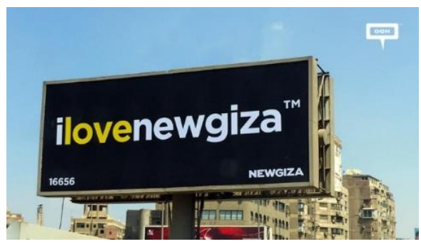
Figure No. (8): a reminder of an external use reminder about the New Giza compound, in which the letters and their height are clear in relation to the height of the advertisement, for easy reading.

3. Readability: The height and thickness of the letter must be taken into consideration given the ratio between the height of the letter and the height of the design where the consumer can see the letters clearly.