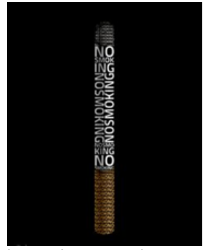
Figure No. (3): An anti-smoking advertisement using vertical writing.

2. Vertical writings: give a feeling of strength, upgrade and dignity.