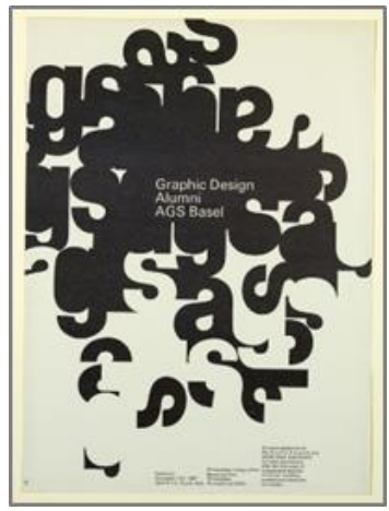
Figure No. (9): Announcement of an art exhibition for the College of Arts & Crafts in which the letters are organized in a reciprocal manner between letters and space, which also constitute letters for a balanced composition and carries the character of the design unit.

4. Typographic space: It consists of a positive form "letters" and space (the spatial background) in which letters are organized and a sense of autism is achieved by visual Compensation, which is represented by the spatial balance and the organization of typographic elements.