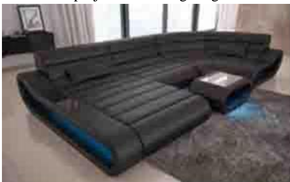
Figure (1) shows the Q4 uses as a bed for couples and seat as the same time