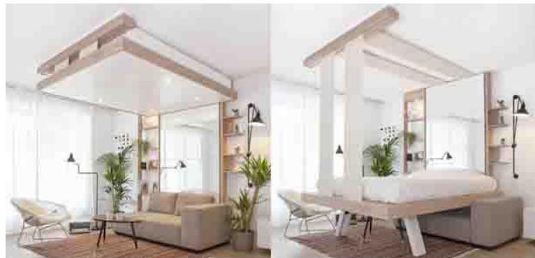
Figure (4) shows bed during use and when it is turned into ceiling

It is equipped with interactive lighting units that recognize sleeping times and different lighting levels depending on the nature of the activity required in the void, (6, p. 143)