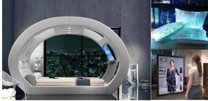
Figure (5) shows future bedroom contents

Beta Living (15) has conceptualized the futuristic bedroom, which includes interactive mirror glass, smart windows, a cabinet that displays its contents through its interactive mirror and a high-tech bed with multiple sensors for user comfort, Figure (5).