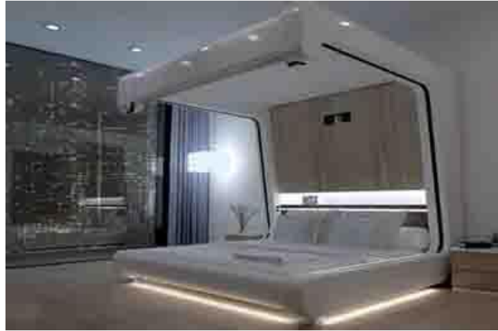
Figure (3) shows The Somnus-Neu Interactive Bed