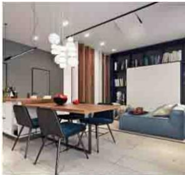
Figure (7) shows Bed has been transformed into a living space and the wall is used as a library for storing books