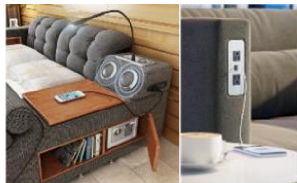
Figure (2) shows Q4 Smart Couch Fittings