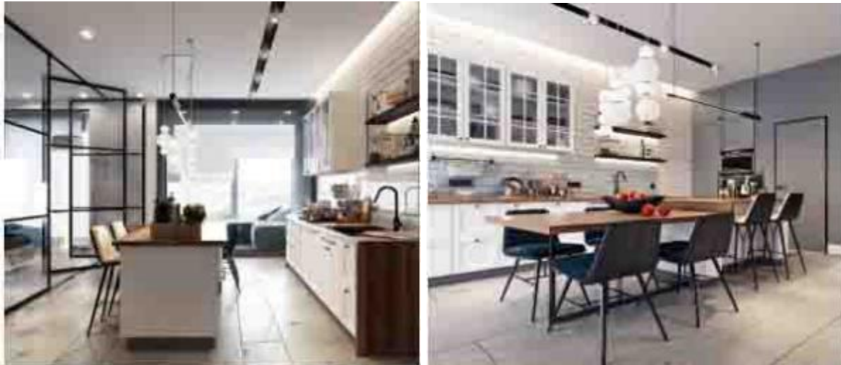
Figure (8) shows the integration of food space with the kitchen in one space using deletable and addable volumes