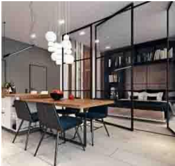
Figure (6) shows Glass movable partitions which changes its transparency according to the user's needs